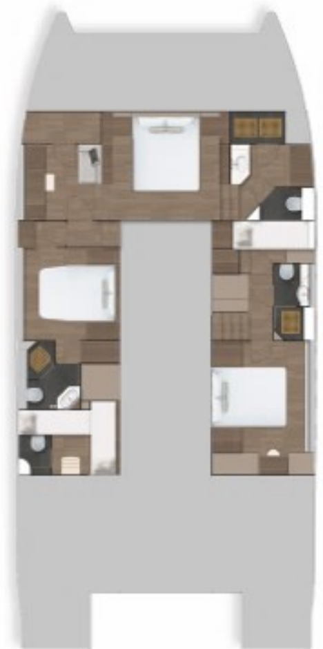
4 CABINS (OPTIONAL)